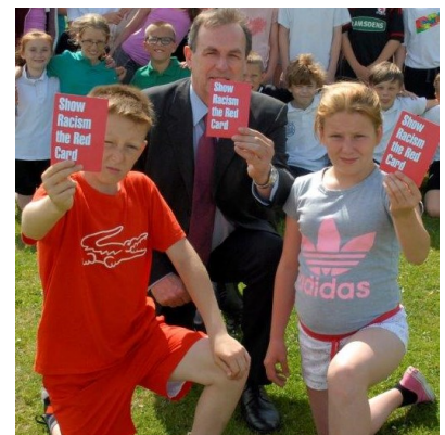
Show Racism the Red Card

My support for Show Racism the Red Card is helping the delivery of anti-racism education workshops in primary and secondary schools across Cleveland. This includes support for four teacher training seminars to ensure teachers are equipped with the skills and expertise to challenge racist attitudes within schools.