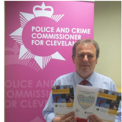
Domestic Abuse and the Workplace Launch

Domestic Abuse is everyone's business - therefore as part of the VAWG strategy, I have developed a Domestic and Sexual Abuse and the Workplace Project to encourage employers in both the public and private sector to take action, so that all staff are safe and supported and that a strong zero tolerance message is sent to those who commit abuse. Organisations are encouraged to develop a policy based on a template developed alongside specialist domestic and sexual abuse support services. Putting policy into practice, organisations are asked to go that step further and identify domestic and sexual abuse champions whose role it is to promote domestic and sexual abuse within their working environment and signpost, if necessary to the specialist support services.