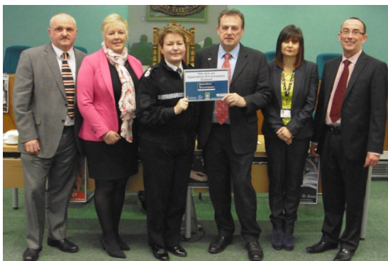
Operation Encompass Launch in Hartlepool

To date organisations involved in the project include; Stages Academy, Clipper Logistics (Wynyard), BT, HMRC (Stockton), Teesside University and others. So far 25 champions have been trained with further training sessions arranged throughout the year. Following the first training sessions, one organisation discussed the project within their workplace and a disclosure was received from a member of staff.