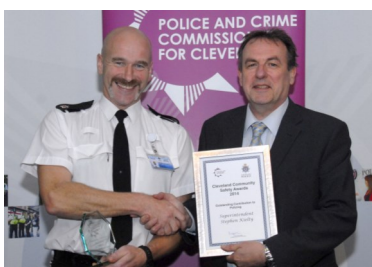
Community Safety Awards 2014

To tackle this, I have worked with Cleveland Police, Local Authorities, Local Criminal Justice Board and others to help develop activities and structures that help to prevent and tackle antisocial behaviour. My antisocial behaviour summits bring partners together to share best practice and explore opportunities for further collaboration and partnership working to drive down crime. As part of the restructured Neighbourhood Watch scheme into a single force-wide scheme, I have actively supported the introduction of Cleveland Connected , a new community messaging service to ensure as many people as possible are aware of local crime and antisocial behaviour issues, including how to protect yourself through crime prevention messages. The scheme was launched in October 2014 and has around 12,000 members.