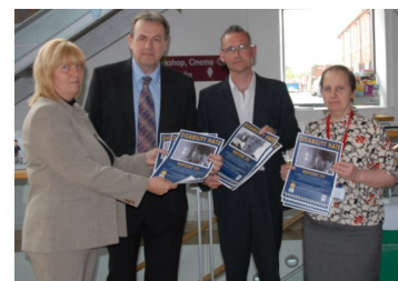
Disability Hate Crime DVD Launch

Police Officers have received training on dealing with and tackling disability hate crime through a training DVD prepared by my office. I actively encourage people to report disability hate crime and continue to develop and support the successful embedded 'Safe Places' scheme throughout Cleveland. Anyone that is feeling vulnerable, typically those with learning disabilities, can use the venues if they are feeling unsafe or have been a victim of hate crime and would like some support.