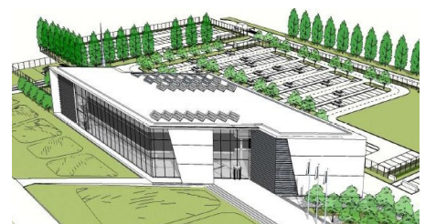
Proposed Community Safety Hub at Hemlington

The Community Safety Hub project has progressed within the last year. Requirements have been discussed to inform the building design, testing this to make sure it can provide the best possible environment to keep officers and staff as productive as possible. This includes how the building will be used to host other agencies to help support critical incidents within the Cleveland area.