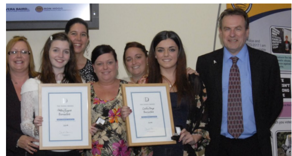
Human Trafficking and Modern Day Slavery event

I hosted a regional Human Trafficking and Modern Day Slavery awareness raising event to highlight the issue from an international, national and local perspective. This was attended by over 120 partners. As a result of number of training events have been delivered to over 200 people to help them to identify issues of potential human trafficking and modern day slavery in their line of work.