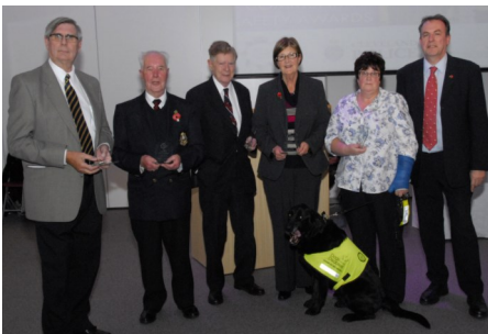
Cleveland Independent Custody Visitors

I have held annual Criminal Justice Volunteers Fairs which so far over 2,000 individuals have attended and expressed an interest in helping in the work of the agencies involved. I will be holding another volunteer fair this year.