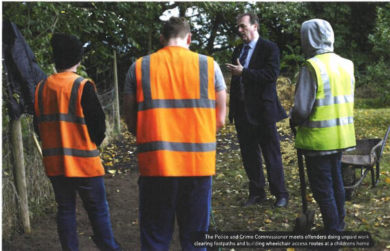
The Police and Crime Commissioner meets offenders doing unpaid work clearing footpaths and building wheelchair access routes at a childrens home