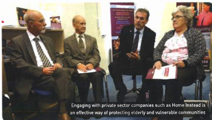
Engaging with private sector companies such as Home Instead is an effective way of protecting elderly and vulnerable communities

I will continue to work with, and in support of, the Strategic Independent Advisory Group. I am committed to effective communication and engagement with all communities and will continue to develop mechanisms such as the 13,000 strong Cleveland Connected network to share information with communities and promote the good work of agencies.