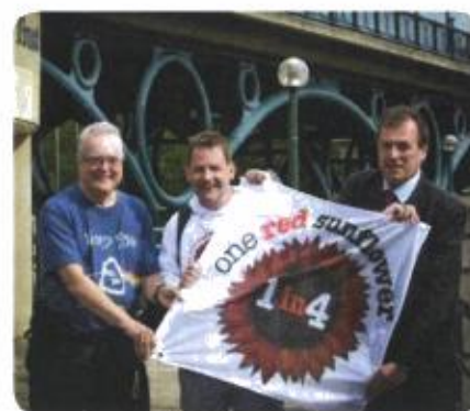
Force and PCC support campaigns to raise awareness of mental health issues

We will review the way in which we offer appropriate support and treatment to offenders through reviews of our current custody and medical services contracts and our arrest referral service.