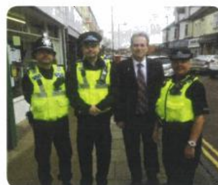
Neighbourhood Policing remains central to our community-focused approach

A programme of cultural awareness sessions and activities which aim to enhance the knowledge and understanding of all officers and staff in supporting the delivery of a culturally sensitive and effective service will be developed and delivered. In addition a programme of training on understanding and identifying unconscious bias, underpinned by a series of equality, diversity and human rights learning opportunities, will be delivered.