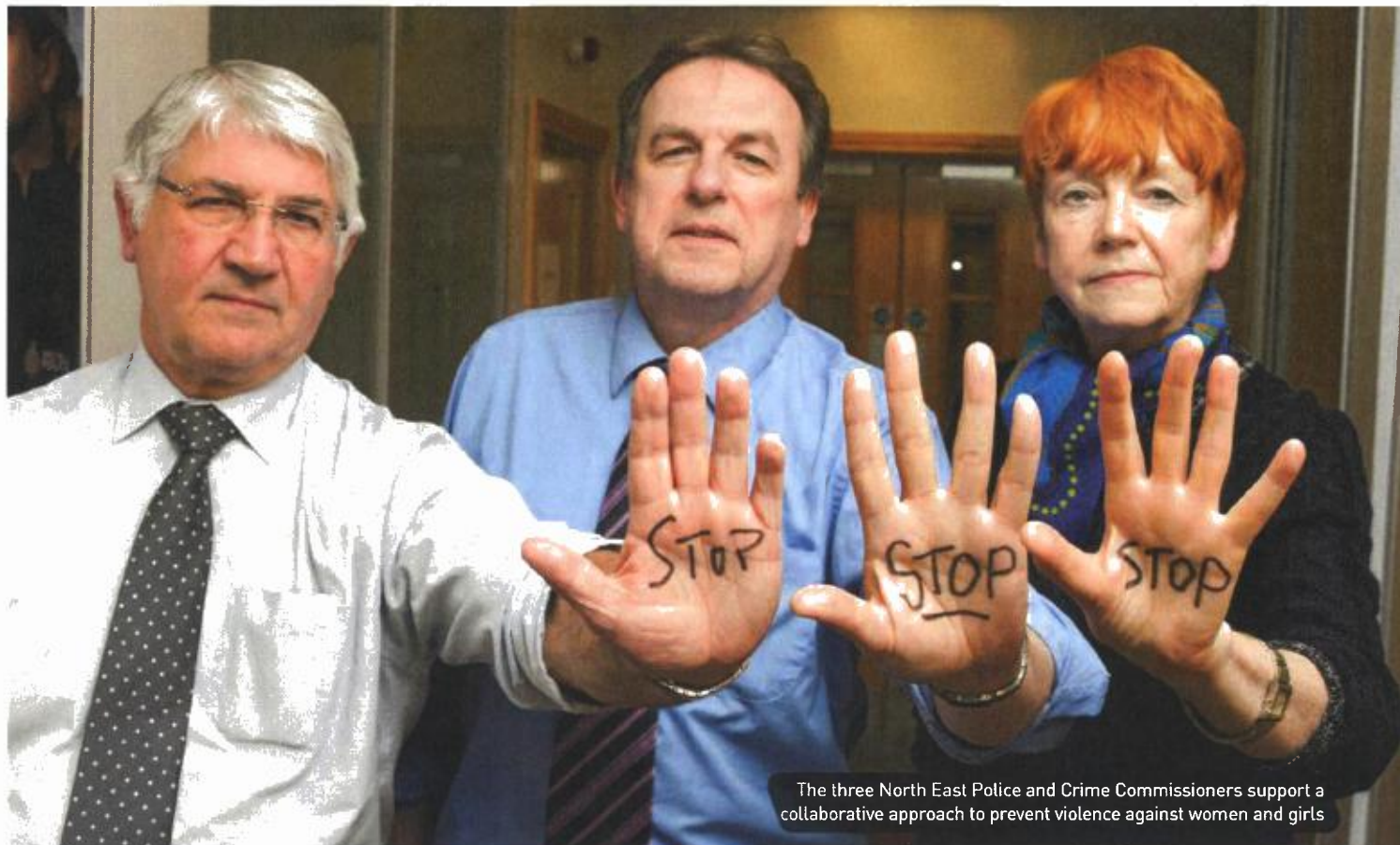
The three North East Police and Crime Commissioners support a collaborative approach to prevent violence against women and girls