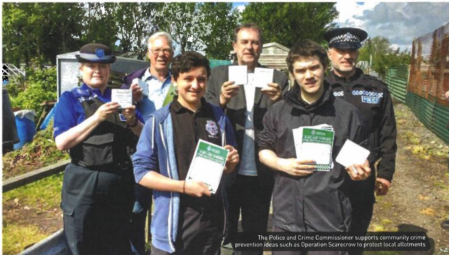
The Police and Crime Commissioner supports community crime prevention ideas such as Operation Scarecrow to protect local allotments